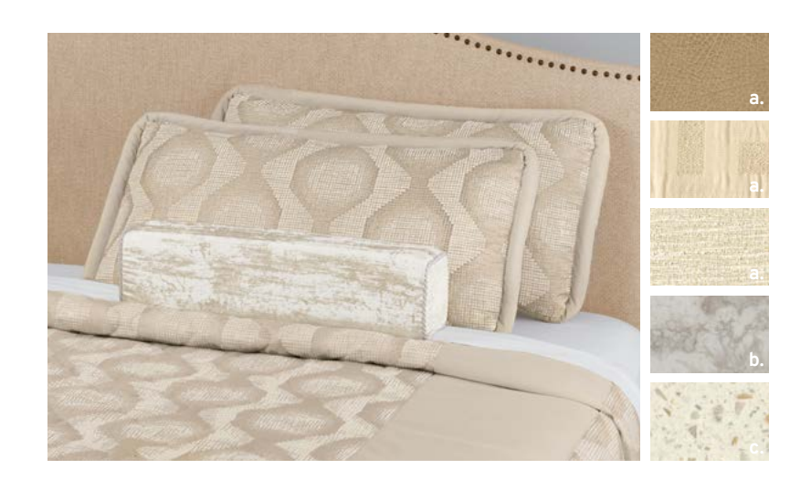
FOUNDRY INTERIOR a. Furniture/Fabric b. Flooring c. Counter Top