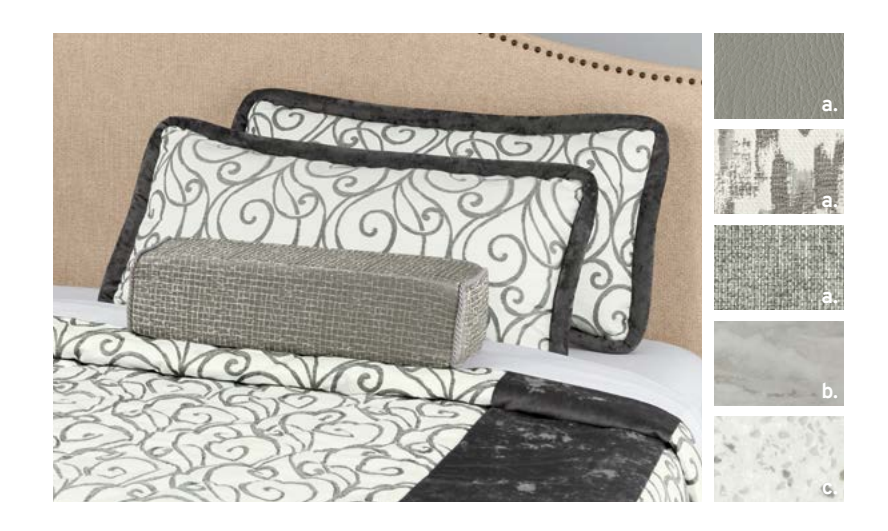
URBAN INTERIOR a. Furniture/Fabric b. Flooring c. Counter Top