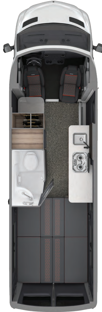
Bench Conversion Down