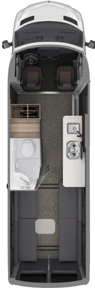
Bench Conversion Up