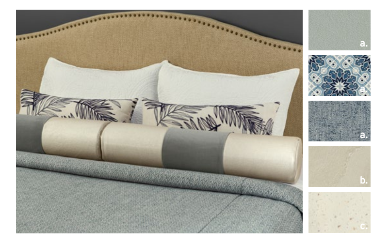
REMMY INTERIOR a. Furniture/Fabric b. Flooring c. Counter Top