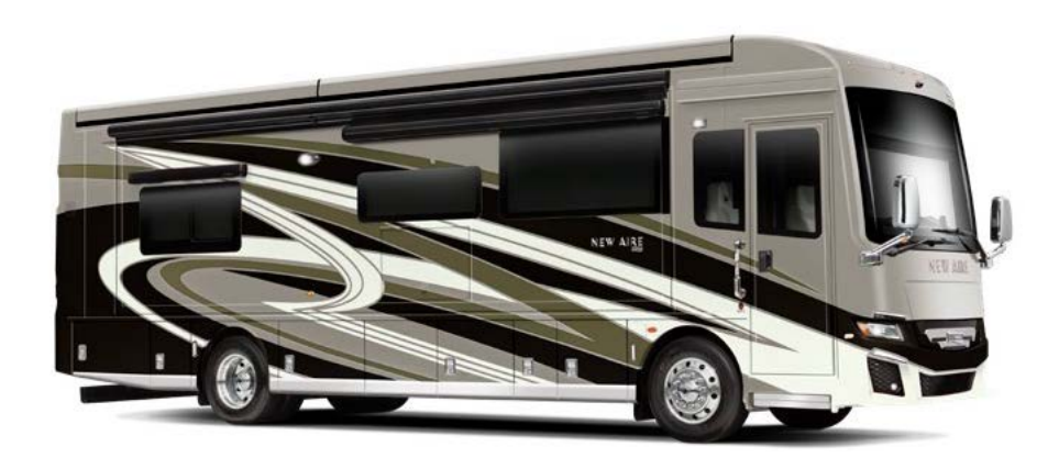
SPARTA EXTERIOR Awning: Charcoal Tweed