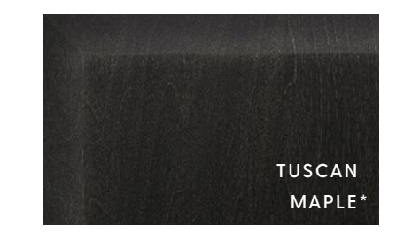
SPARTA INTERIOR a. Furniture/Fabric b. Flooring c. Counter Top

*Available in High Gloss or Suede Finish