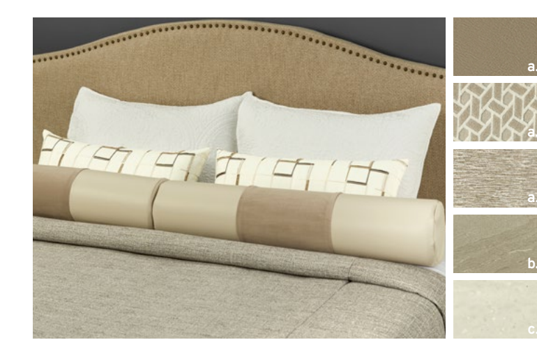
KINGSLEY INTERIOR a. Furniture/Fabric b. Flooring c. Counter Top