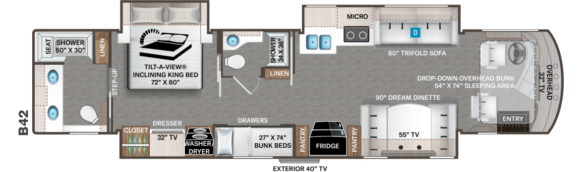
SHOWER STACK WASHER/DRYER O TILT-A-VIEWS INCLINING KING BED 72" X 80" RETRACTABLE 55" TV