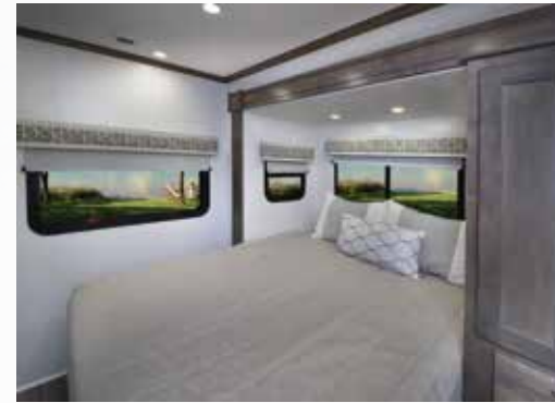
24FW shown with Driftwood II cabinetry and Milano décor.