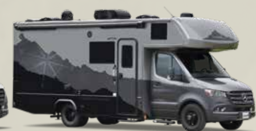
Freedom Edition Dark

shown with optional black aluminum wheels