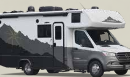
Freedom Edition Light