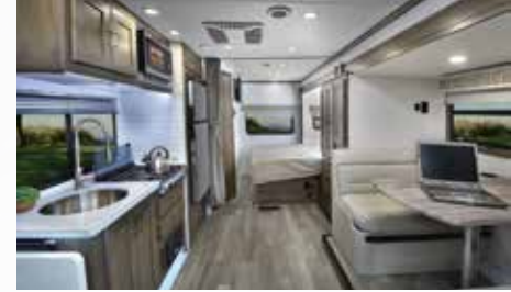
24FW shown with Driftwood II cabinetry and Milano décor.