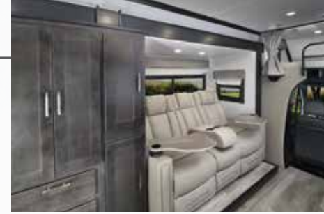
24FW shown with Shadow cabinetry and Crescent décor.