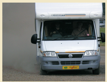
Swift Suntour Motorhome demonstrating a controlled blow-out at 55 mph. The vehicle remained under full control and completed a slalom course.

Tyron UK Castle Business Park, Pavilion Way, Loughborough, Leicestershire. LE11 5GW Tel: +44 (0)1509 377 677.