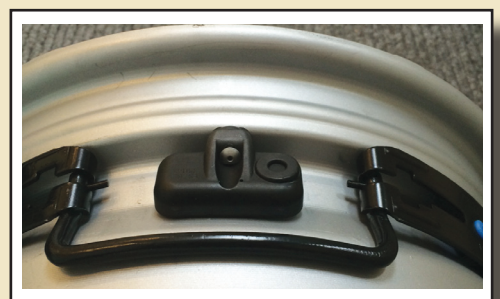
Special TPMS brackets are available to fit around wheel sensors if you have a Tyre Pressure Monitoring system fitted.