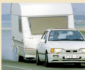
On repeated tests, including 113 mph caravan tyre blow-out and 106 mph emergency stop - the vehicle pulled up under control - no drama, no damage! Without the caravan, this vehicle completed 4 Km with a flat front wheel at speeds up to 130 mph. Again, complete control was maintained. Tyre and alloy rim undamaged!