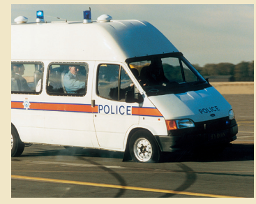
Testing after double front blow-out, running with 11 police officers on board maintaining full control and no damage to either wheel