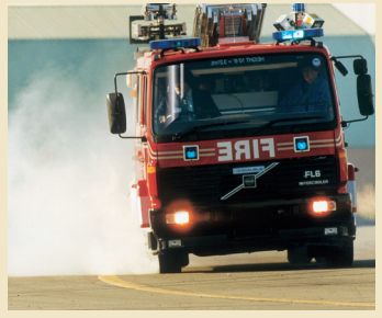
Sabre type B Water Tender fully laden in controlled blow-out at 60 mph. The vehicle remained controllable, turning and following a tight course. The driver did not have to take any corrective action.